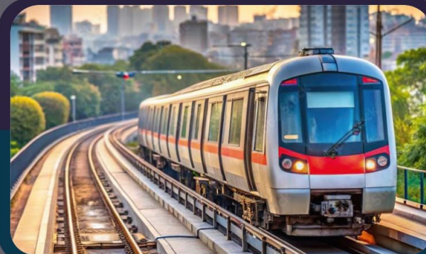
MONO RAIL CONNECTIVITY AHMEDABAD-DHOLERA