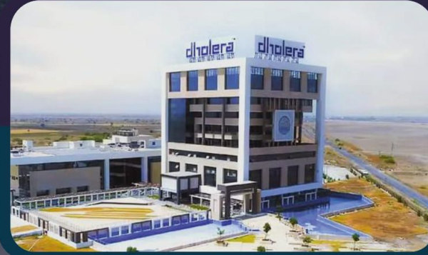
ABCD BUILDING (ADMINISTRATIVE CUM BUSINESS CENTRE FOR DHOLERA)