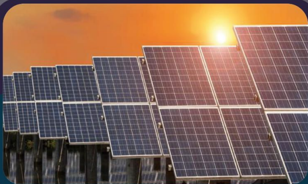
WORLD'S LARGEST SOLAR PARK (5000 MW)