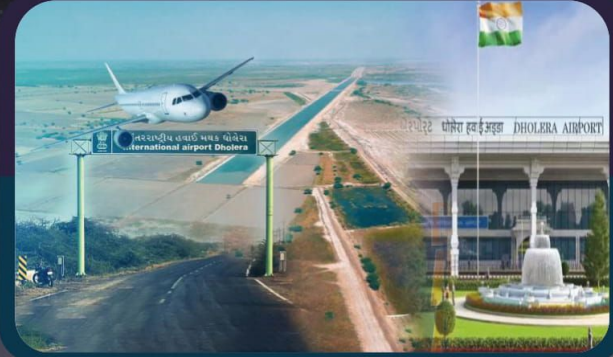
DHOLERA INTERNATIONAL AIRPORT