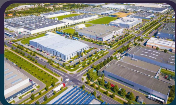
GREEN FIELD INDUSTRIAL PARK